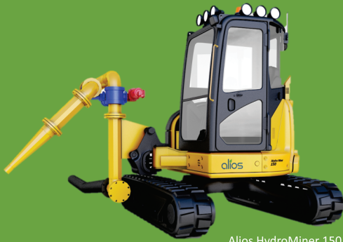
Alios HydroMiner 150

Alios is an environmentally aware mining company that aims to create a safe and sustainable working environment for our employees, our customers and the surrounding communities.