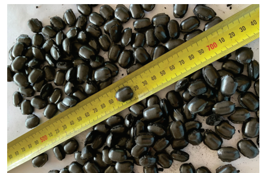
Met Coal Pellets produced from Bowen Basin Tailings Resource

Eliminating a hazard will also eliminate any risks associated with that hazard.