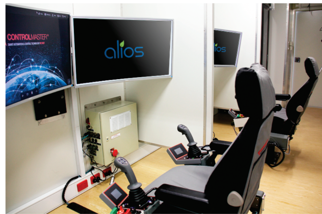
Alios Tele-remote HydroMiner Control Room - Multi Unit